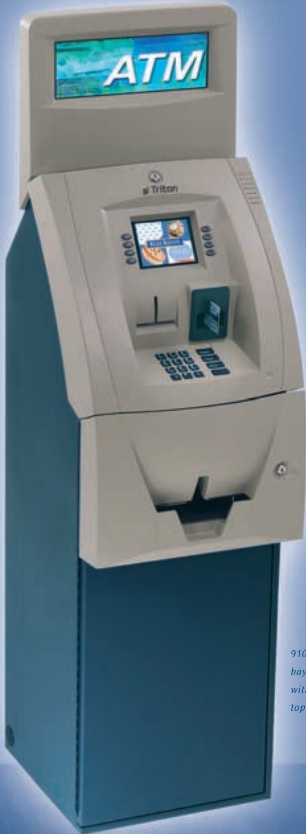
9100 in bayou bronze with backlit topper

The 9100 is our best selling ATM. This extremely popular machine was designed to be the lowest cost high-performance ATM in the industry. And it has proven to be perfectly suited for owners who need functionality and performance at a lower price point.