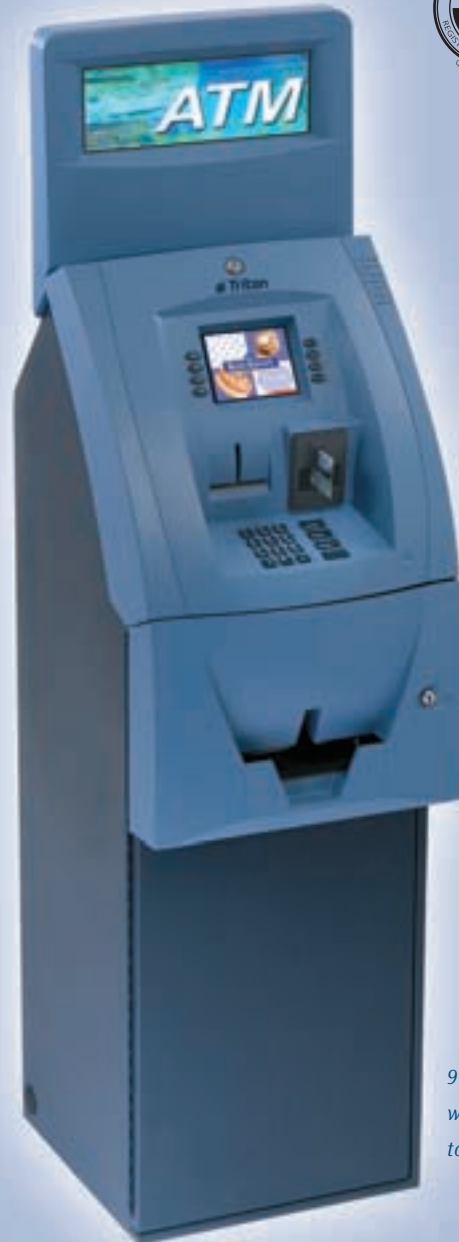
9100 in blue with backlit topper